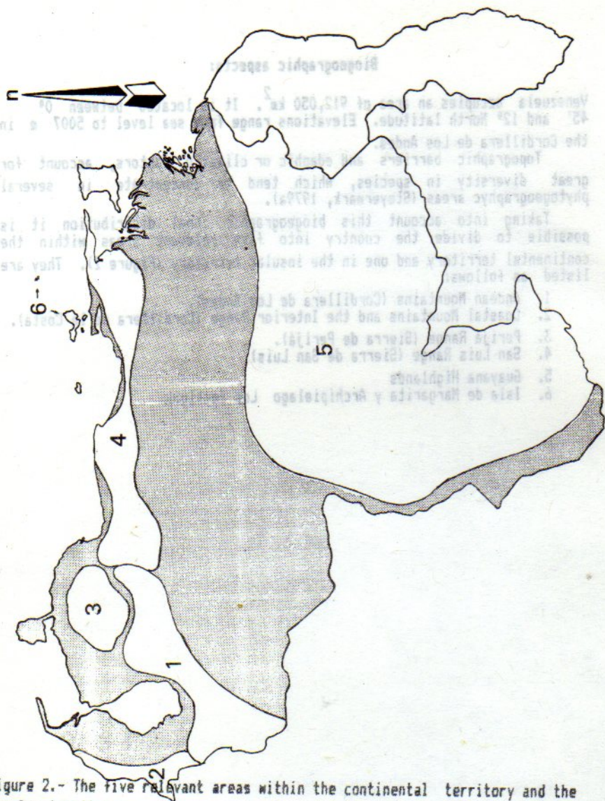
Figure 2.- The five relevant areas within the continental territory and the insular territory.